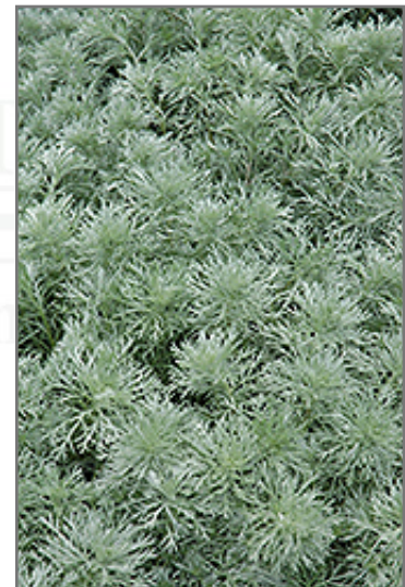
Silver Mound Artemisia foliage