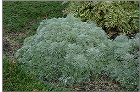
Silver Mound Artemisia

Silver Mound Artemisia is recommended for the following landscape applications;