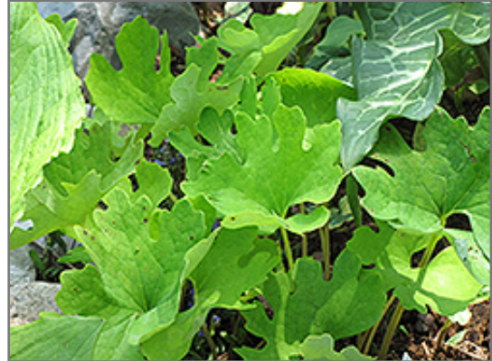
Bloodroot foliage

Bloodroot is recommended for the following landscape applications;