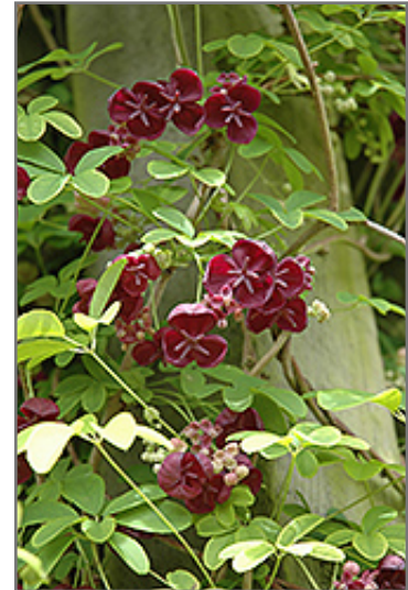
Fiveleaf Akebia flowers

Fiveleaf Akebia is a multi-stemmed deciduous woody vine with a twining and trailing habit of growth. Its relatively fine texture sets it apart from other landscape plants with less refined foliage.