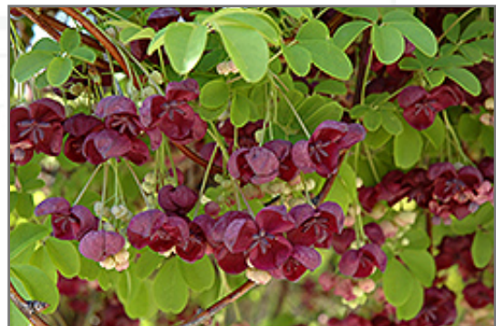
Fiveleaf Akebia flowers