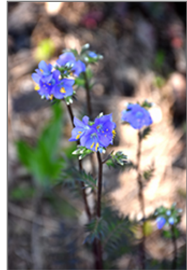
Purple Rain Jacob's Ladder flowers

This dark variety presents an attractive mound of deep bronze-purple, lacy foliage on dark red stems; large, blue flowers rise up in early to mid-summer; looks great in the middle to front of the border and easily mixes with other plants