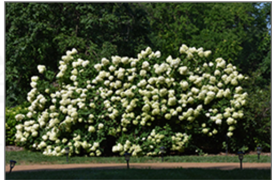
Limelight Hydrangea in bloom