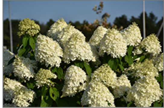
Limelight Hydrangea flowers

Limelight Hydrangea is recommended for the following landscape applications;