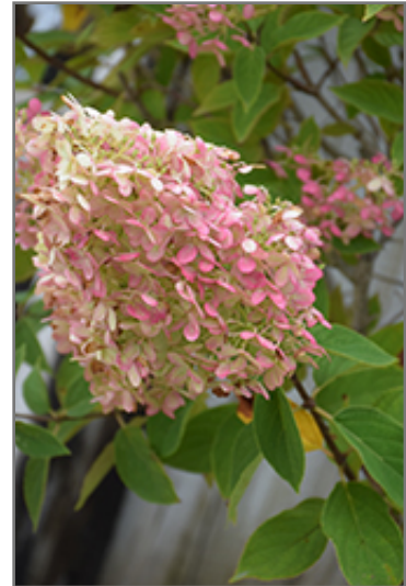
Limelight Hydrangea flowers (faded)

This shrub performs well in both full sun and full shade. It prefers to grow in average to moist conditions, and shouldn't be allowed to dry out. It is not particular as to soil type or pH. It is highly tolerant of urban pollution and will even thrive in inner city environments. Consider applying a thick mulch around the root zone in winter to protect it in exposed locations or colder microclimates. This is a selected variety of a species not originally from North America.