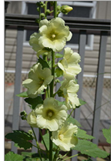
Spotlight Sunshine Hollyhock flowers

This is a high maintenance plant that will require regular care and upkeep, and should only be pruned after flowering to avoid removing any of the current season's flowers. It is a good choice for attracting hummingbirds to your yard, but is not particularly attractive to deer who tend to leave it alone in favor of tastier treats. Gardeners should be aware of the following characteristic(s) that may warrant special consideration;