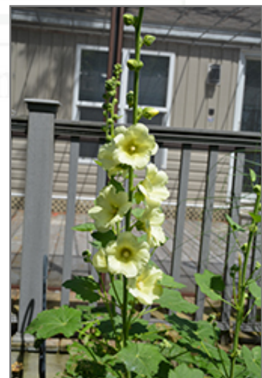
Spotlight Sunshine Hollyhock in bloom