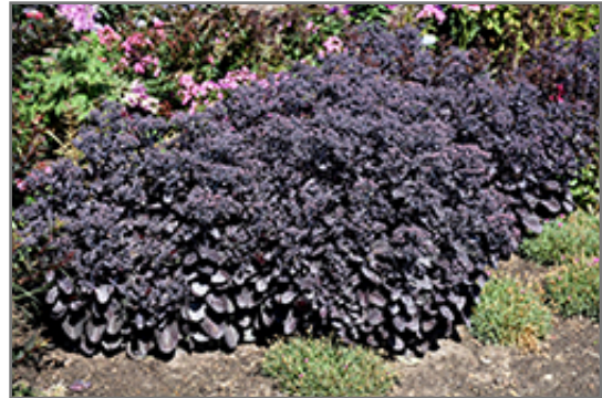
Rock 'N Grow Back in Black Stonecrop in bloom

Rock 'N Grow Back in Black Stonecrop has masses of beautiful clusters of creamy white star-shaped flowers with cherry red eyes at the ends of the stems from late summer to early fall, which emerge from distinctive crimson flower buds, and which are most effective when planted in groupings. The flowers are excellent for cutting. Its attractive large succulent round leaves emerge burgundy in spring, turning black in colour with showy dark gray variegation and tinges of coppery-bronze throughout the season. The deep purple stems are very colorful and add to the overall interest of the plant.