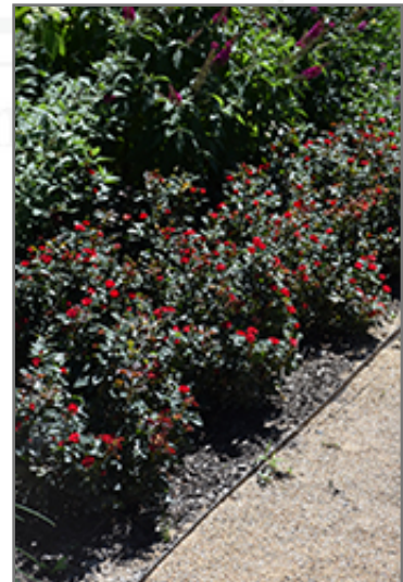
Petite Knock Out Rose in bloom