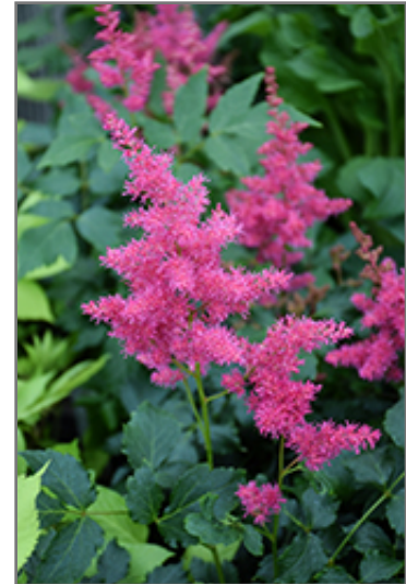
Younique Ruby Red Astilbe flowers

Younique Ruby Red Astilbe is recommended for the following landscape applications;