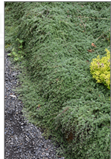
Wooly Thyme