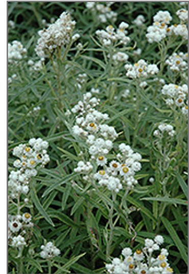
Pearly Everlasting flowers