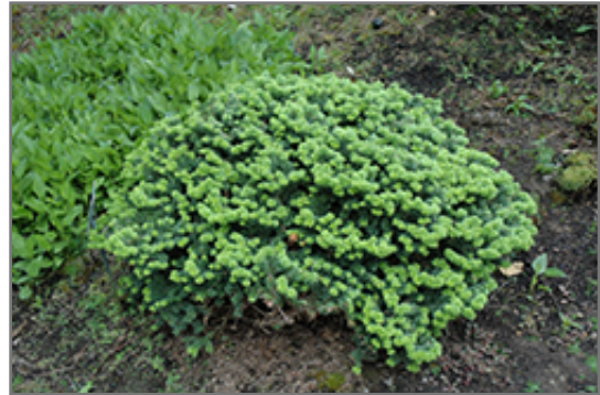
Dwarf Balsam Fir