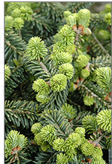
Dwarf Balsam Fir foliage