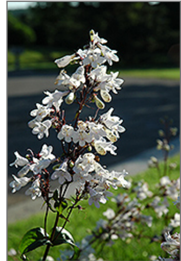
Husker Red Beard Tongue flowers

Husker Red Beard Tongue is recommended for the following landscape applications;