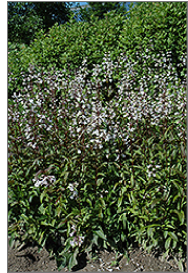
Husker Red Beard Tongue in bloom

Husker Red Beard Tongue is a fine choice for the garden, but it is also a good selection for planting in outdoor pots and containers. With its upright habit of growth, it is best suited for use as a 'thriller' in the 'spiller-thriller-filler' container combination; plant it near the center of the pot, surrounded by smaller plants and those that spill over the edges. Note that when growing plants in outdoor containers and baskets, they may require more frequent waterings than they would in the yard or garden. Be aware that in our climate, most plants cannot be expected to survive the winter if left in containers outdoors, and this plant is no exception. Contact our experts for more information on how to protect it over the winter months.