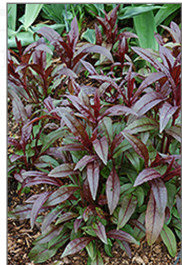
Husker Red Beard Tongue foliage