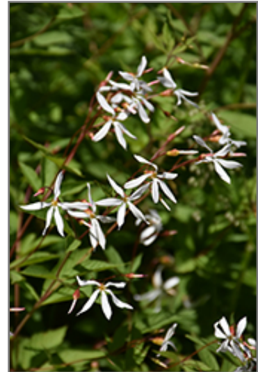
Bowman's Root flowers

Bowman's Root is a dense herbaceous perennial with a mounded form. Its medium texture blends into the garden, but can always be balanced by a couple of finer or coarser plants for an effective composition.