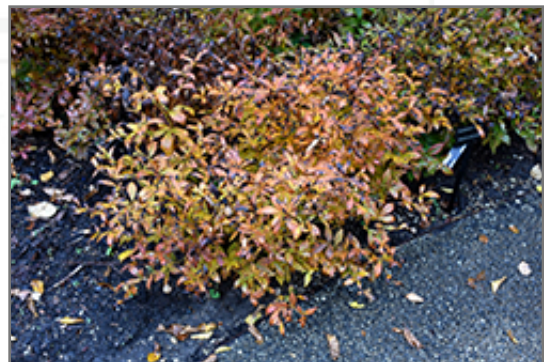
Bowman's Root in fall