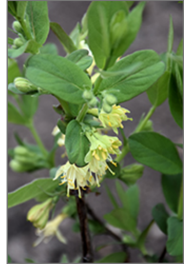
Boreal Blizzard Honeyberry flowers

This shrub is quite ornamental as well as edible, and is as much at home in a landscape or flower garden as it is in a designated edibles garden. It does best in full sun to partial shade. It prefers dry to average moisture levels with very well-drained soil, and will often die in standing water. It is not particular as to soil type or pH. It is highly tolerant of urban pollution and will even thrive in inner city environments. This is a selected variety of a species not originally from North America.