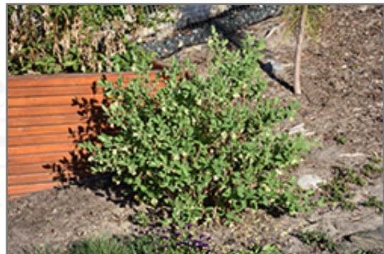
Boreal Blizzard Honeyberry in bloom