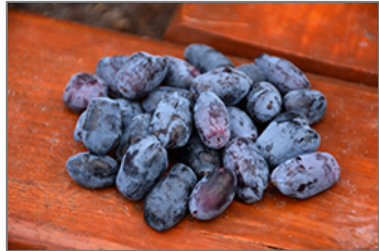
Boreal Blizzard Honeyberry fruit

Boreal Blizzard Honeyberry features subtle chartreuse flowers along the branches in early spring. It has green deciduous foliage. The narrow leaves do not develop any appreciable fall colour. It features an abundance of magnificent navy blue berries with powder blue overtones from early to mid summer.