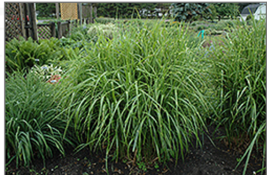
Porcupine Grass