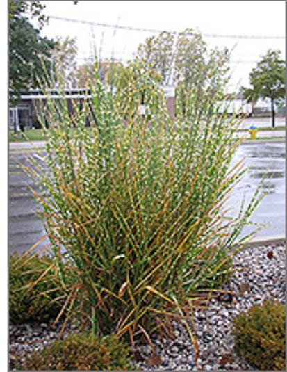
Porcupine Grass

Porcupine Grass is recommended for the following landscape applications;