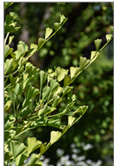
Goldspire Ginkgo foliage