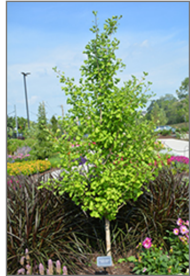
Goldspire Ginkgo