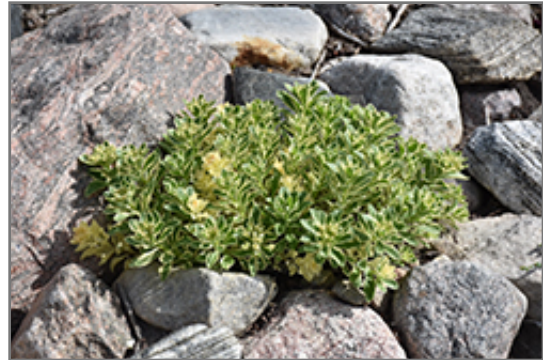
Atlantis Stonecrop