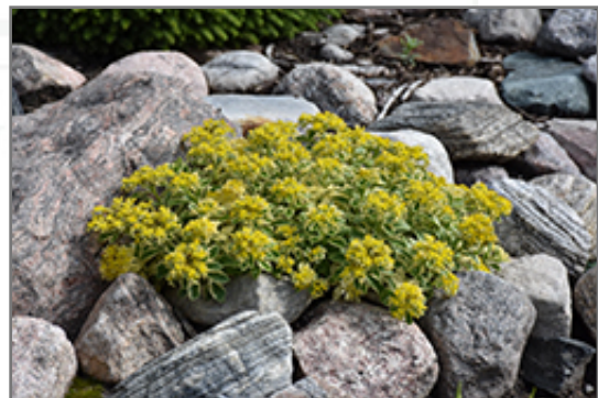
Atlantis Stonecrop in bloom