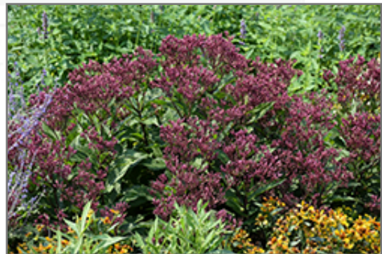
Euphoria Ruby Joe Pye Weed in bloom