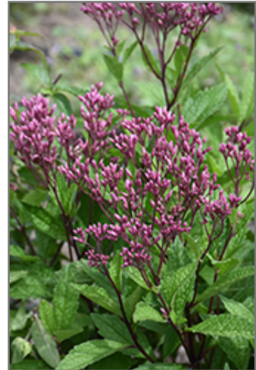
Euphoria Ruby Joe Pye Weed flowers

This plant does best in full sun to partial shade. It prefers to grow in average to dry locations, and dislikes excessive moisture. It is not particular as to soil type or pH. It is somewhat tolerant of urban pollution. This is a selection of a native North American species. It can be propagated by division; however, as a cultivated variety, be aware that it may be subject to certain restrictions or prohibitions on propagation.