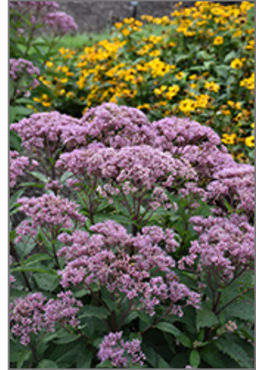
Euphoria Ruby Joe Pye Weed flowers

Euphoria Ruby Joe Pye Weed is an herbaceous perennial with an upright spreading habit of growth. Its wonderfully bold, coarse texture can be very effective in a balanced garden composition.