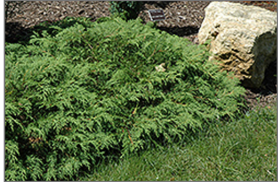
Russian Cypress