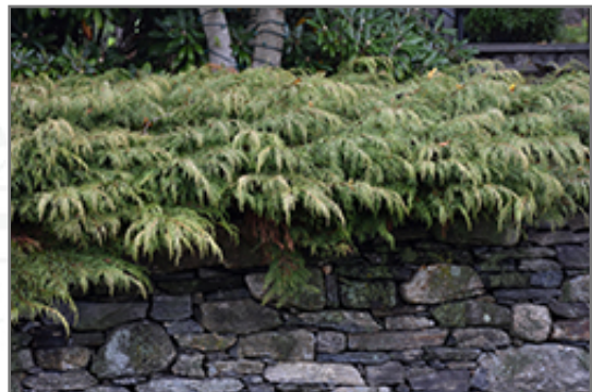
Russian Cypress