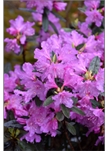
P.J.M. Checkmate Rhododendron flowers