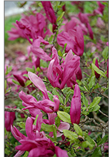
Susan Magnolia flowers

Susan Magnolia is recommended for the following landscape applications;