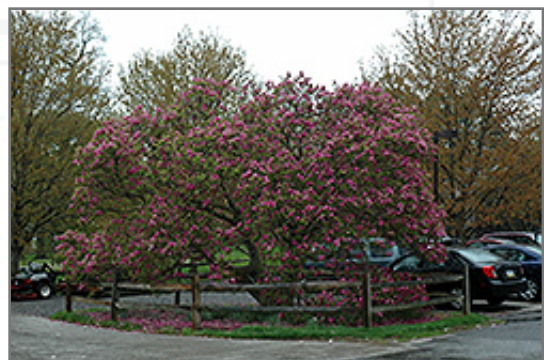
Susan Magnolia in bloom