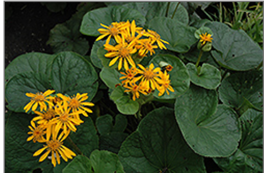
Desdemona Rayflower flowers