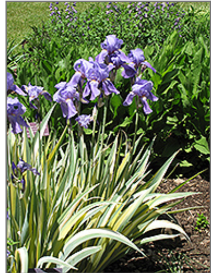
Golden Variegated Sweet Iris in bloom

Golden Variegated Sweet Iris is recommended for the following landscape applications;