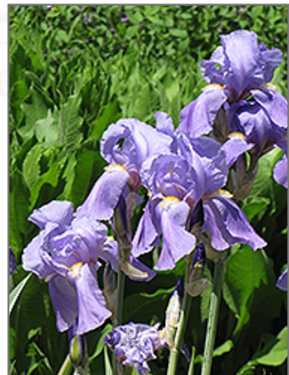
Golden Variegated Sweet Iris flowers