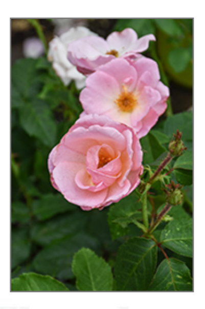
Peachy Knock Out Rose flowers

Peachy Knock Out Rose is a multi-stemmed deciduous shrub with an upright spreading habit of growth. Its average texture blends into the landscape, but can be balanced by one or two finer or coarser trees or shrubs for an effective composition.