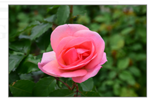
Peachy Knock Out Rose flowers