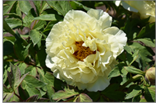
High Noon Tree Peony flowers