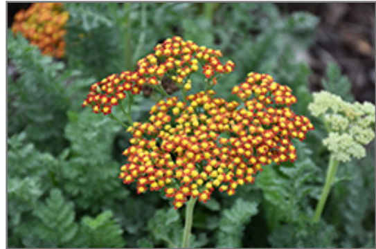
Sassy Summer Sunset Yarrow flowers

Sassy Summer Sunset Yarrow is recommended for the following landscape applications;