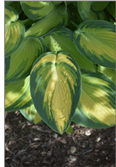
June Hosta foliage

This plant does best in partial shade to shade. It prefers to grow in average to moist conditions, and shouldn't be allowed to dry out. It is not particular as to soil type or pH. It is somewhat tolerant of urban pollution. This particular variety is an interspecific hybrid. It can be propagated by division; however, as a cultivated variety, be aware that it may be subject to certain restrictions or prohibitions on propagation.