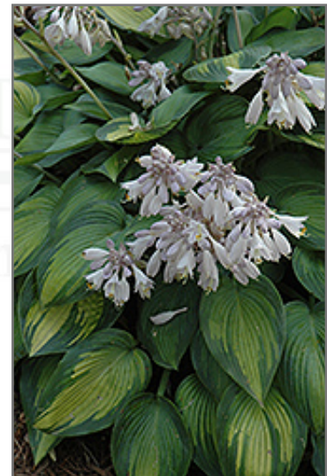
June Hosta flowers