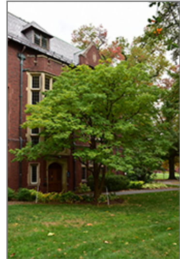
Amur Maackia

Amur Maackia is recommended for the following landscape applications;