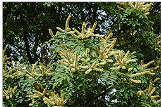
Amur Maackia flowers