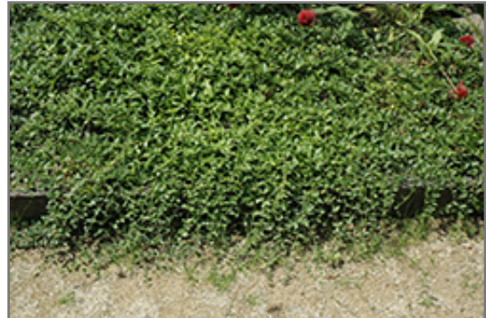
Bowles Cunningham Periwinkle

Bowles Cunningham Periwinkle is recommended for the following landscape applications;