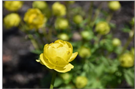
Lemon Supreme Globeflower flowers