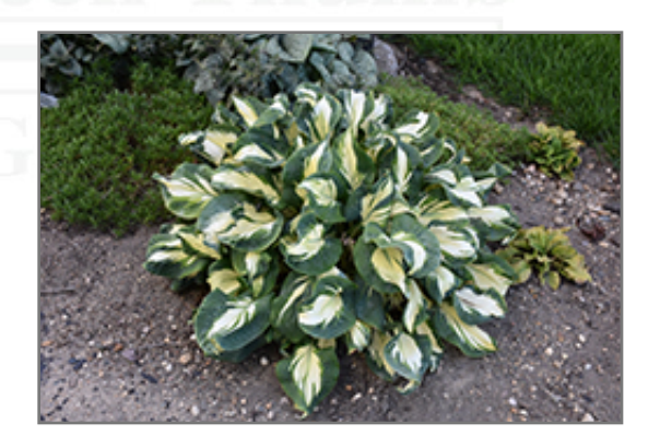
Hans Hosta