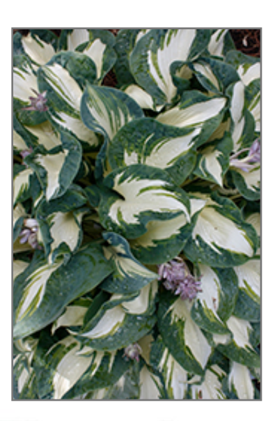
Hans Hosta foliage

This is a relatively low maintenance plant, and is best cleaned up in early spring before it resumes active growth for the season. Gardeners should be aware of the following characteristic(s) that may warrant special consideration;