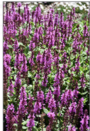
Rose Marvel Meadow Sage flowers