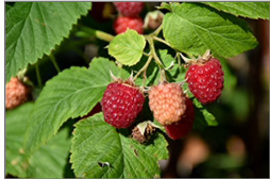
Latham Raspberry fruit

Latham Raspberry has rich green deciduous foliage on a plant with an upright spreading habit of growth. The fuzzy oval compound leaves do not develop any appreciable fall colour. It features an abundance of magnificent red berries in mid summer.