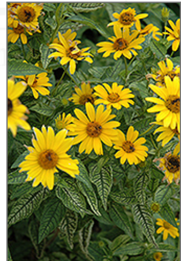
Loraine Sunshine False Sunflower flowers