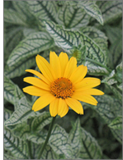
Loraine Sunshine False Sunflower flowers

This is a relatively low maintenance plant, and is best cleaned up in early spring before it resumes active growth for the season. It is a good choice for attracting butterflies to your yard. It has no significant negative characteristics.