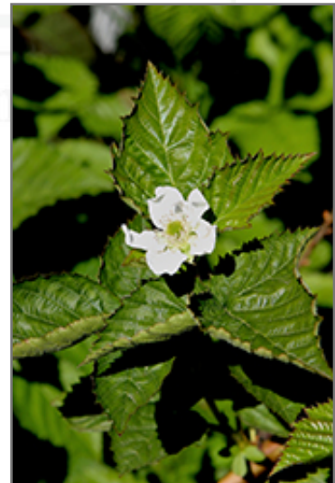
Jostaberry flowers