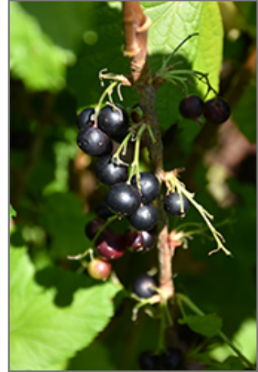
Jostaberry fruit

Jostaberry has rich green deciduous foliage on a plant with an upright spreading habit of growth. The lobed leaves turn yellow in fall. It features an abundance of magnificent plum purple berries in early summer, which fade to black over time.