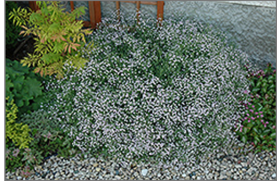
Common Baby's Breath in bloom