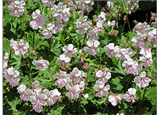
Biokovo Cranesbill in bloom

This plant will require occasional maintenance and upkeep, and should be cut back in late fall in preparation for winter. Deer don't particularly care for this plant and will usually leave it alone in favor of tastier treats. Gardeners should be aware of the following characteristic(s) that may warrant special consideration;