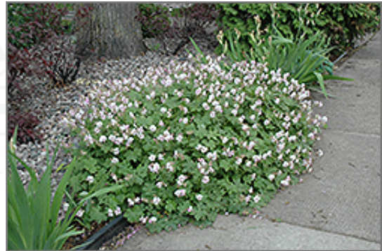
Biokovo Cranesbill in bloom