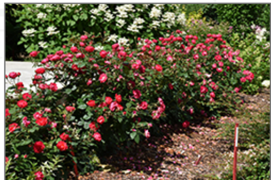
Oso Easy Double Red Rose in bloom