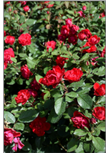
Oso Easy Double Red Rose flowers

This shrub should only be grown in full sunlight. It does best in average to evenly moist conditions, but will not tolerate standing water. It is not particular as to soil type or pH. It is somewhat tolerant of urban pollution. This particular variety is an interspecific hybrid.