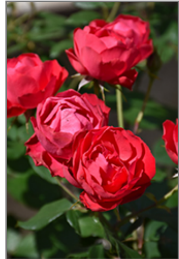
Oso Easy Double Red Rose flowers