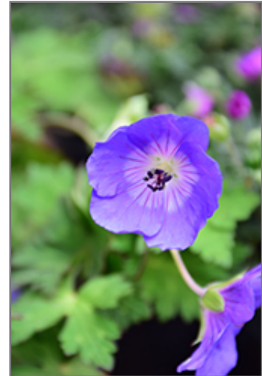
Rozanne Cranesbill flowers

Rozanne Cranesbill is an herbaceous perennial with a mounded form. Its relatively fine texture sets it apart from other garden plants with less refined foliage.