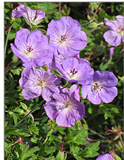
Rozanne Cranesbill flowers