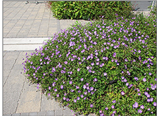
Rozanne Cranesbill in bloom

Rozanne Cranesbill is a fine choice for the garden, but it is also a good selection for planting in outdoor containers and hanging baskets. It is often used as a 'filler' in the 'spiller-thriller-filler' container combination, providing a mass of flowers against which the thriller plants stand out. Note that when growing plants in outdoor containers and baskets, they may require more frequent waterings than they would in the yard or garden. Be aware that in our climate, most plants cannot be expected to survive the winter if left in containers outdoors, and this plant is no exception. Contact our experts for more information on how to protect it over the winter months.