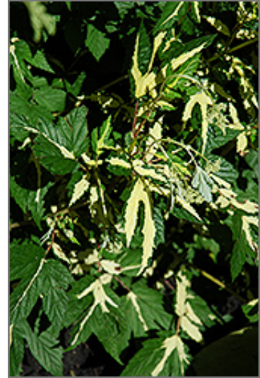
Variegated Queen Of The Meadow foliage

This plant does best in partial shade to shade. It is quite adaptable, preferring to grow in average to wet conditions, and will even tolerate some standing water. It is not particular as to soil pH, but grows best in rich soils. It is somewhat tolerant of urban pollution. Consider applying a thick mulch around the root zone over the growing season to conserve soil moisture. This is a selected variety of a species not originally from North America. It can be propagated by division; however, as a cultivated variety, be aware that it may be subject to certain restrictions or prohibitions on propagation.