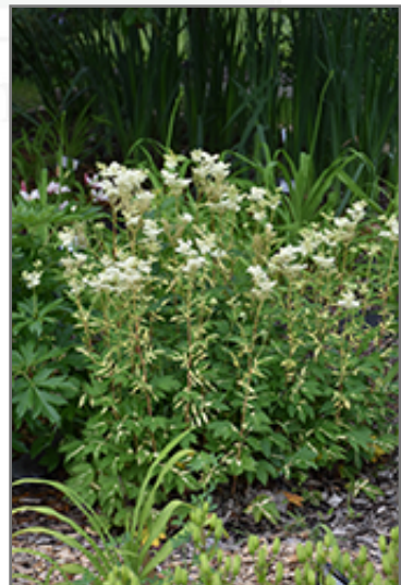
Variegated Queen Of The Meadow in bloom