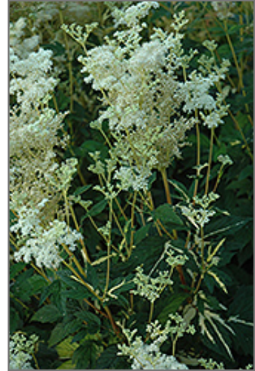
Variegated Queen Of The Meadow flowers

Variegated Queen Of The Meadow is recommended for the following landscape applications;