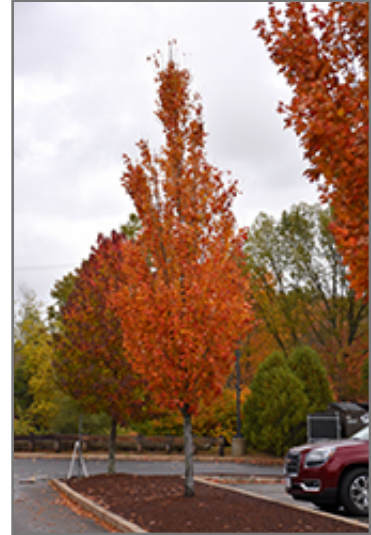
Armstrong Gold Maple in fall

This tree should only be grown in full sunlight. It is quite adaptable, preferring to grow in average to wet conditions, and will even tolerate some standing water. It is not particular as to soil type or pH. It is highly tolerant of urban pollution and will even thrive in inner city environments. This particular variety is an interspecific hybrid.