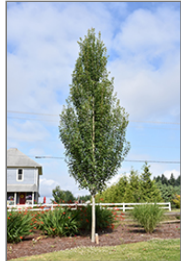
Armstrong Gold Maple

Armstrong Gold Maple is recommended for the following landscape applications;