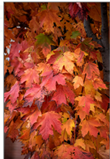
Armstrong Gold Maple in fall