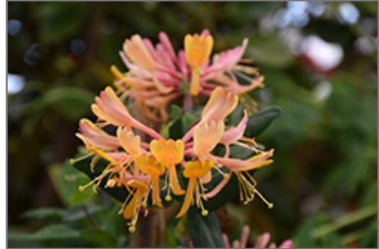
Goldflame Honeysuckle flowers

Goldflame Honeysuckle is recommended for the following landscape applications;