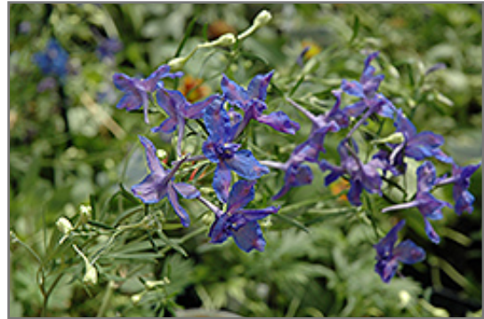
Blue Butterfly Delphinium flowers