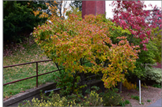
Winterberry in fall

This shrub does best in full sun to partial shade. It prefers to grow in moist to wet soil, and will even tolerate some standing water. It is very fussy about its soil conditions and must have rich, acidic soils to ensure success, and is subject to chlorosis (yellowing) of the foliage in alkaline soils. It is somewhat tolerant of urban pollution. Consider applying a thick mulch around the root zone in winter to protect it in exposed locations or colder microclimates. This species is native to parts of North America.