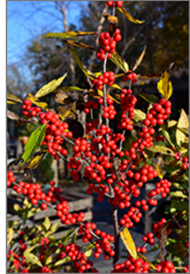
Winterberry fruit

This shrub will require occasional maintenance and upkeep, and is best pruned in late winter once the threat of extreme cold has passed. It is a good choice for attracting birds to your yard. Gardeners should be aware of the following characteristic(s) that may warrant special consideration;