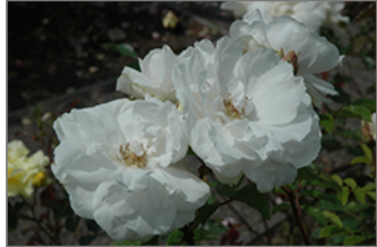
Sir Thomas Lipton Rose flowers