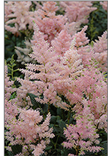
Peach Blossom Astilbe flowers

Peach Blossom Astilbe is an herbaceous perennial with an upright spreading habit of growth. Its relatively fine texture sets it apart from other garden plants with less refined foliage.