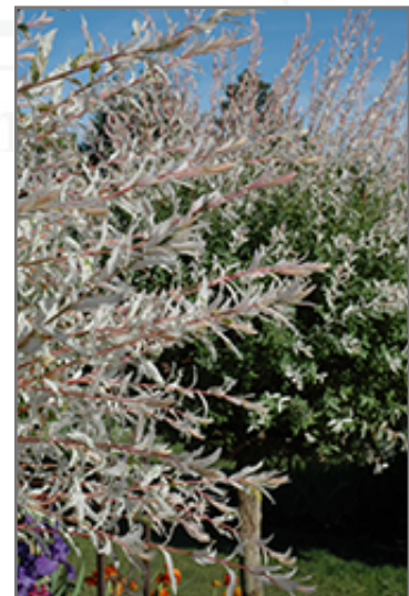
Tricolor Willow (tree form) foliage