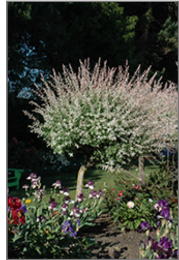
Tricolor Willow (tree form)

Tricolor Willow (tree form) is a fine choice for the yard, but it is also a good selection for planting in outdoor pots and containers. With its upright habit of growth, it is best suited for use as a 'thriller' in the 'spiller-thriller-filler' container combination; plant it near the center of the pot, surrounded by smaller plants and those that spill over the edges. It is even sizeable enough that it can be grown alone in a suitable container. Note that when grown in a container, it may not perform exactly as indicated on the tag - this is to be expected. Also note that when growing plants in outdoor containers and baskets, they may require more frequent waterings than they would in the yard or garden. Be aware that in our climate, most plants cannot be expected to survive the winter if left in containers outdoors, and this plant is no exception. Contact our experts for more information on how to protect it over the winter months.