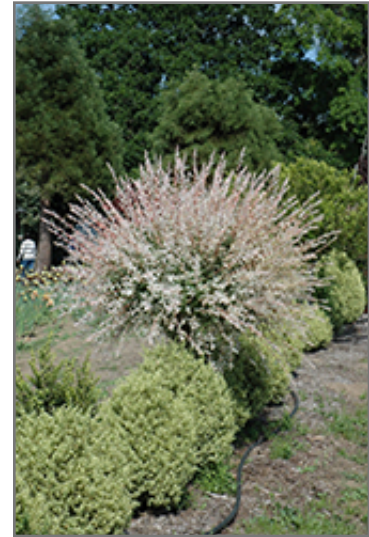
Tricolor Willow (tree form) in spring

Tricolor Willow (tree form) is recommended for the following landscape applications;