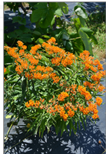
Butterfly Weed in bloom