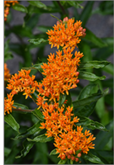
Butterfly Weed flowers

Butterfly Weed is recommended for the following landscape applications;