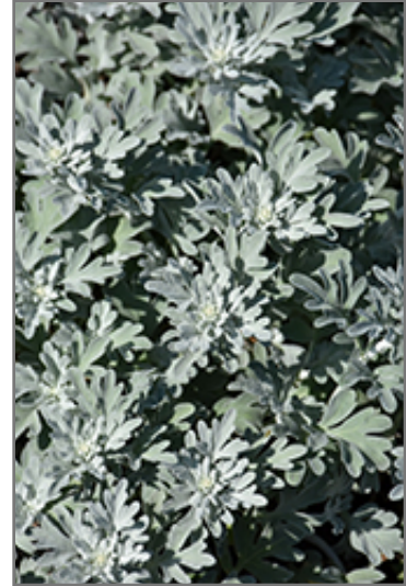
Silver Brocade Artemisia foliage

Silver Brocade Artemisia is recommended for the following landscape applications;