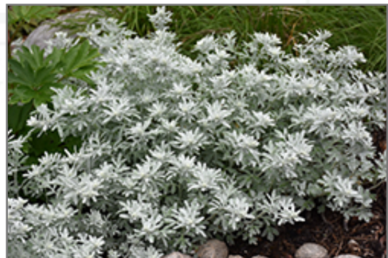
Silver Brocade Artemisia